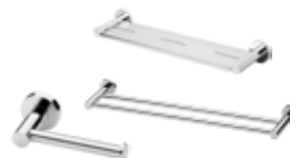
Phoenix Radii accessories incl. shower shelf (RA886CHR) double towel rail (RA813CHR) toilet roll holder (RA892CHR)