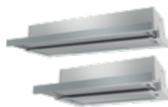
Westinghouse 600mm & 900mm Slideout Rangehood (WRR604SB & WRR904SB)