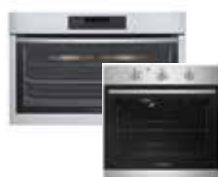
Westinghouse 600mm & 900mm Electric Oven (WVE613SC & WVE915SCA)