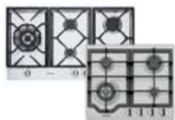
Westinghouse 600mm & 900mm Gas Cooktop (WHG644SC & WHG958SC)