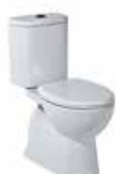
Seima Select Close Coupled Toilet Suite (191786)