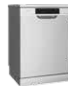
Westinghouse 600mm Freestanding Dishwasher (WSF6606XA)