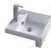
Seima Kyra 215 Semi Recessed Square Basin (191486)